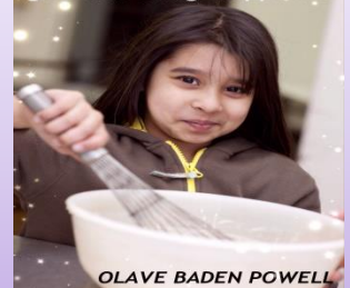
OLAVE BADEN POWELL

Remember, it is not what you have but what you give that brings happiness